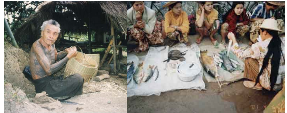
The villagers living along the Salween River in Shan State, Burma

The only thing Burma does not receive from the Asian Development Bank (ADB) is direct financial assistance. But the ADB is actively engaging with Burma's military regime in many different ways. The ADB sends consultative missions to Burma to make findings and advice on macroeconomic and other reforms. The ADB also issues Country Assistance Plans for Burma. A representative of the ruling military regime sits on the ADB's Board of Executive Directors.